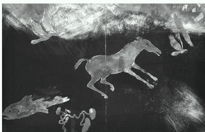
Painting as language:

"Let's take painting as an example of a signal transmitting a coded message."